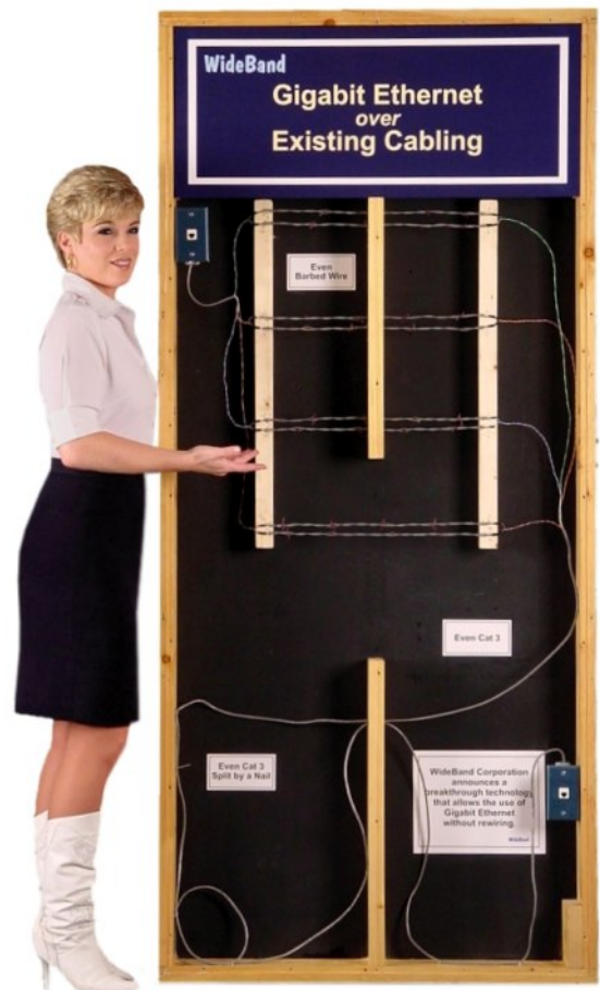
WideBand GbE is demonstrated carrying data reliably over poorly installed Cat 3 cable – and even over Barbed Wire!